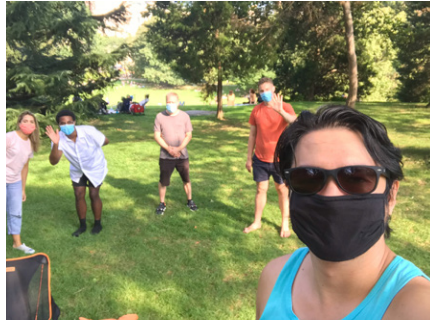
The 20s/30s Group at a socially distanced picnic in Central Park

St. Bart’s participated in the non-partisan NYC Interfaith Coalition working with Reclaim Our Vote (ROV) to combat voter suppression and encourage voter registration in several states. Parishioners did heroic work in postcarding throughout the summer (over 50,000 cards sent from the coalition).