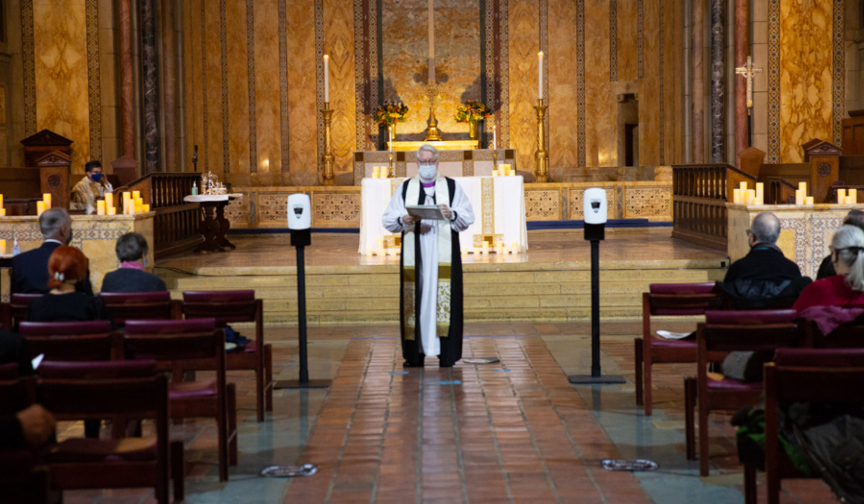
In-person worship service, Fall 2020