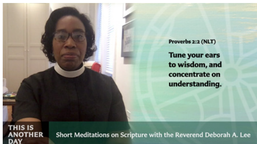
This is Another Day video series