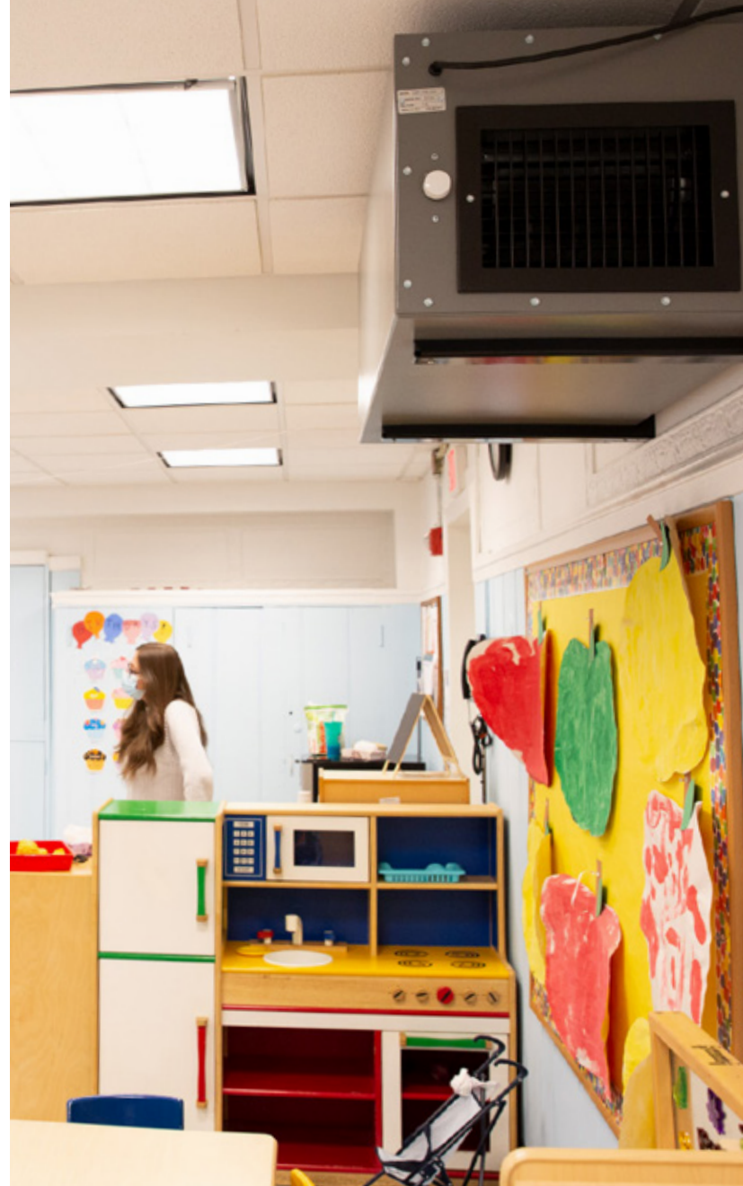
New air filtration units disinfect the air in preschool classrooms

While we know things are far from "Normal," the children are not aware of this. They are happy and thriving. They love school and their friends. St. Bart's Preschool celebrates that we have been able to continue to operate safely together!