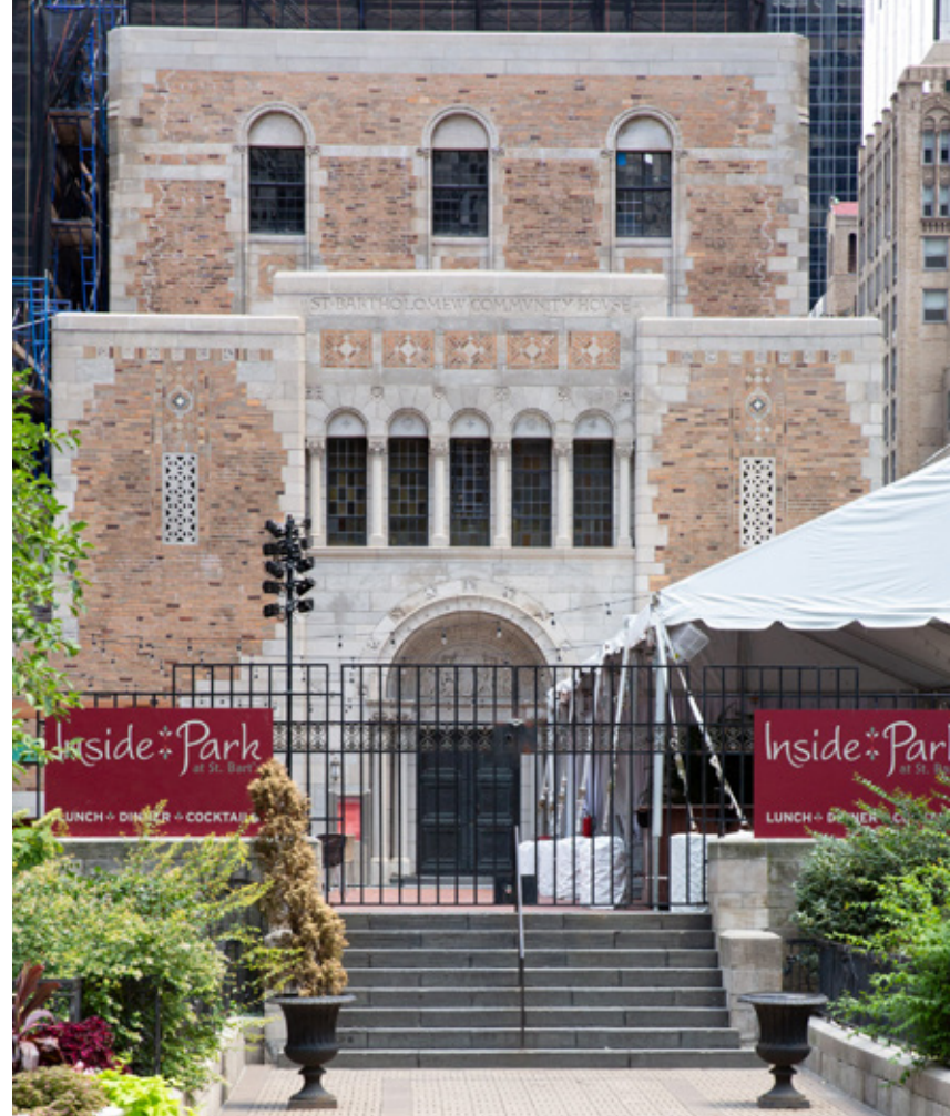
Restored facade of the Community House

There's always a building project to do that's not eligible for restricted TDR funds. For example, eight of the ten multi-stack HVAC units that keep Church and Community House cool and de-humidified reached the end of their useful lives and were replaced for $92,000. The pool was refurbished (grouting, pipes, plumbing, masonry, acid-washing) for $80,000. Additional air filtration and ventilation equipment was