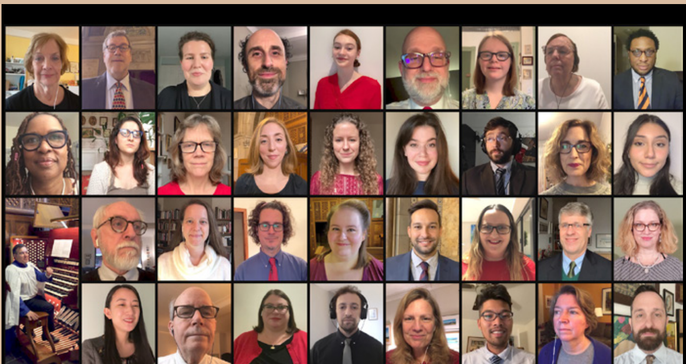
St. Bartholomew's Choir, Choristers, and St. Bart's Singers recording from home.

Outside of worship, choral and organ music from St. Bart's attracted over 150,000 views on social media even before Christmas.