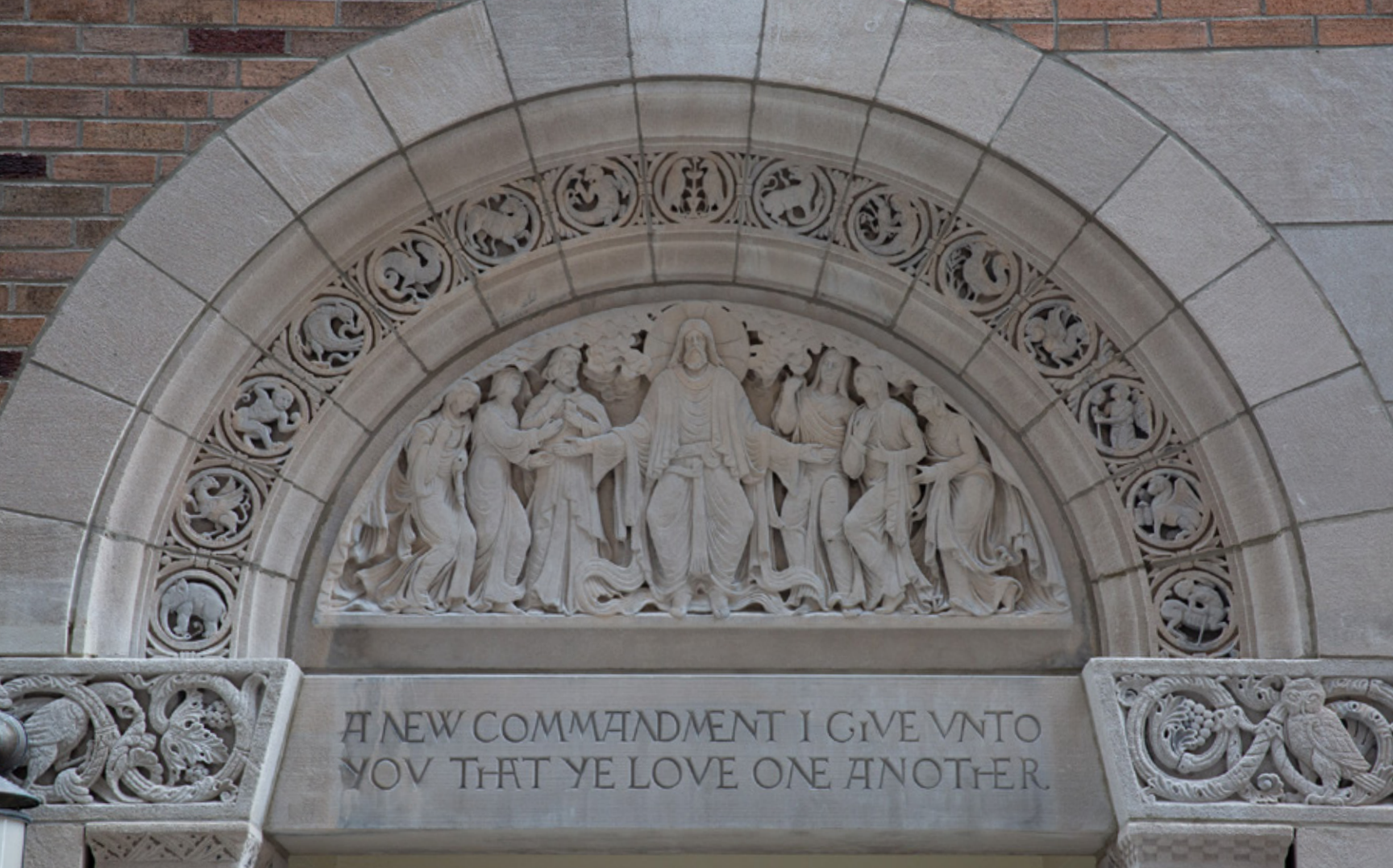
Restored facade of the Community House, 109 East 50th Street entrance.