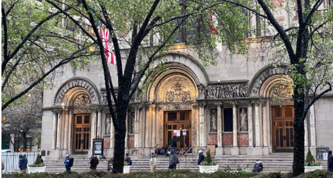
The line for breakfast at Crossroads Community stretches around the block by 7 am on Sunday, April 12, 2020

We fed hungry people through Crossroads Community Services until we were unable to continue due to the pandemic. So, we stepped back, created new safety protocols, and then started again. We created zealous hygiene protocols in order to reopen the St. Bartholomew's Community Preschool. We offered compassionate pastoral care to the sick and to the frightened, and we extended comfort to the grieving and the dying. We buried the dead with honor and dignity.